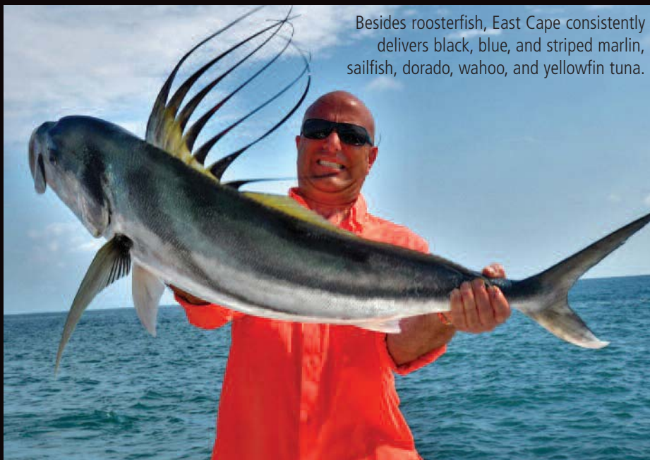
Besides roosterfish, East Cape consistently delivers black, blue, and striped marlin, sailfish, dorado, wahoo, and yellowfin tuna.

dise Village Marina, and his staff continue to manage the marina with an infectious enthusiasm wrapped in a fine-tuned expertise that only comes with years of experience. PV Fish Company ( www.pvfishco.com ) has been established to accommodate visiting anglers, assuring that guests enjoy a quality trip. They offer a variety of trips, inshore for roosters, pargo, jacks, etc., as well as offshore to Corbetenia, El Banco, and the 1,000-fathom curve for tuna and marlin. They have four well-appointed 30-plus-foot sport fishers, one panga, and a larger 60-foot sport fisher all with English-speaking crews that can handle groups of up to 10 passengers. All boats offer 20-plus-knot cruise speeds and are equipped with top-of-the-line tackle. Custom packages that can include hotel accommodations are also available.