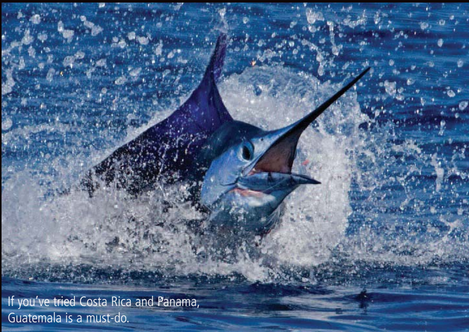
If you've tried Costa Rica and Panama, Guatemala is a must-do.

ing is for you, then so are the Van Wormer Resorts.