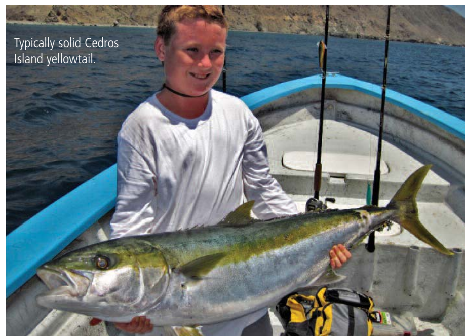
Typically solid Cedros Island yellowtail.