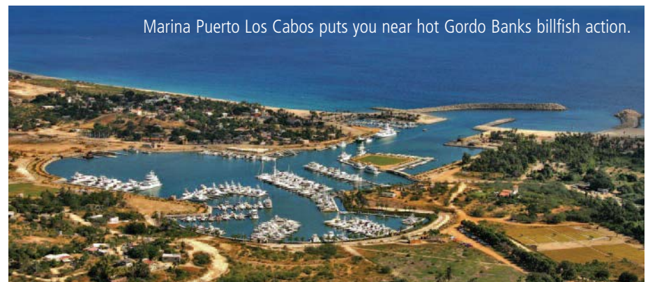
Marina Puerto Los Cabos puts you near hot Gordo Banks billfish action.

The heart of the master plan for Puerto Los Cabos is the new marina, which establishes a new standard of excellence